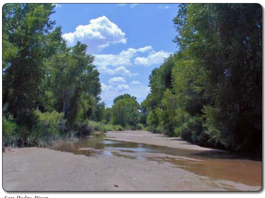
San Pedro River

As part of this effort, the Partnership has made a commitment to eliminate deficit groundwater pumping and reach sustainable yield of the aquifer by 2011. Sustainable yield means that groundwater is managed so that it will last for an indefinite period of time — meeting the needs of the community and the SPRNCA — without causing unacceptable environmental, economic or social consequences. Some of the needs to be considered in this delicate balancing act include the following: