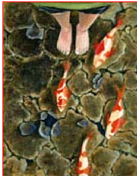
Remembered Water Eunsil Chio, Age 17 River of Words Art Contest