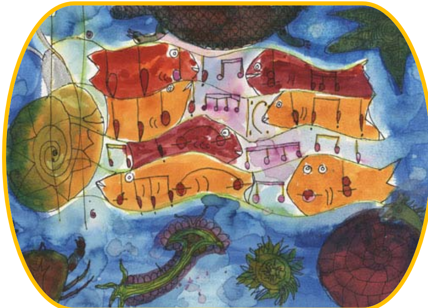
Water Song , Mina Darham, Age 10 "River of Words" Art Contest